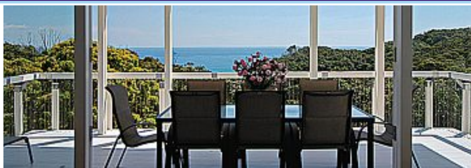
Lighthouse Road amazing 180 degree views Large 4 bed 3 bath home 840m2 $5.5M