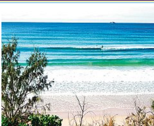
Belongil Absolute Beachfront House plus studio 1,750m2 on 2 titles $4.9M