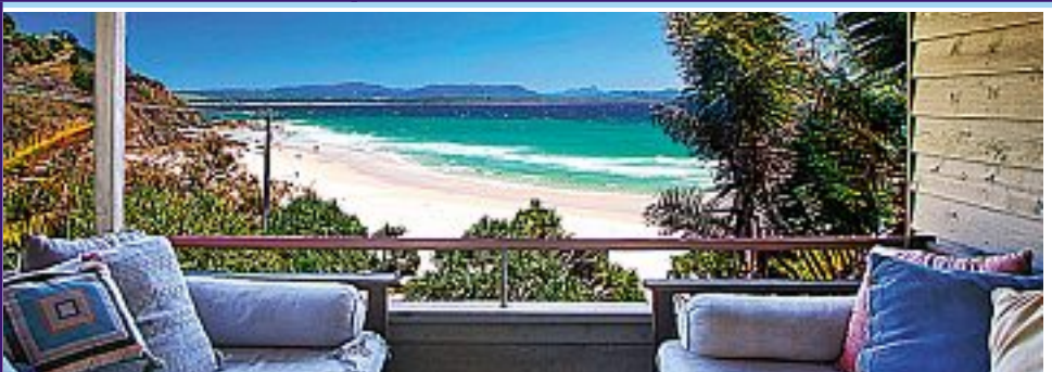
Marine Parade Front row Watego's Beach P.O.A