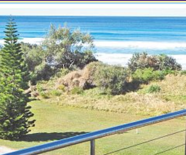
Linneaus Beach House 280 acres Private Estate FIRB Approved US$3M